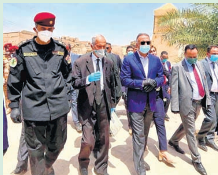
Iraqi Prime Minister Mustafa al-Kadhimi, center, visits the site of the Al-Nuri mosque, which was destroyed by Islamic State militants, during his visit to Mosul, Iraq, Wednesday, June 10, 2020.